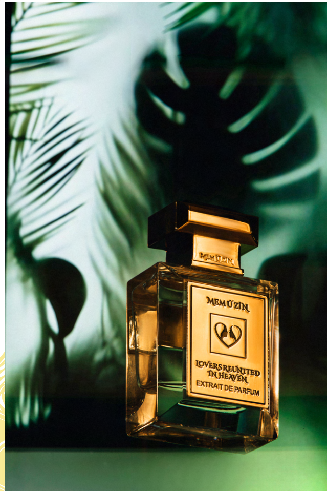
LOVERS REUNITED IN HEAVEN EXTRAIT DE PARFUM