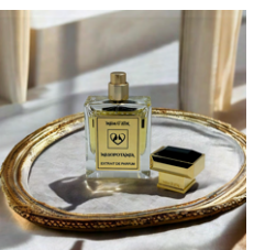
MESOPOTAMIA EXTRAIT DE PARFUM 100 ML