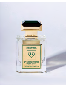
LOVERS REUNITED IN HEAVEN EXTRAIT DE PARFUM 100 ML