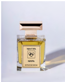
ALSAHRA EXTRAIT DE PARFUM 100 ML

ISTANBUL reflects a magnificent blend of historical and modern texture in this unique city. It will make you feel like you are wandering the streets of this magical city every time you spray it. Whether you are an Istanbulite living in this magnificent city or just a fan, this perfume will always take you back to ISTANBUL.