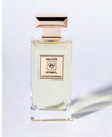
ISTANBUL EXTRAIT DE PARFUM 100 ML

MEDITERRENIAN perfume offers much more than just a scent; this is an experience inspired by the Mediterranean itself. You will find the salty breeze of the sea, olive trees surrounded by the hot sun and the peace of a quiet coastal town in this bottle.