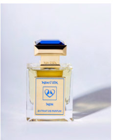
MEM EXTRAIT DE PARFUM 100 ML