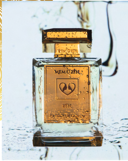
ZIN EXTRAIT DE PARFUM