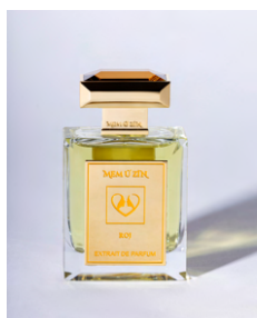
ROJ EXTRAIT DE PARFUM 100 ML