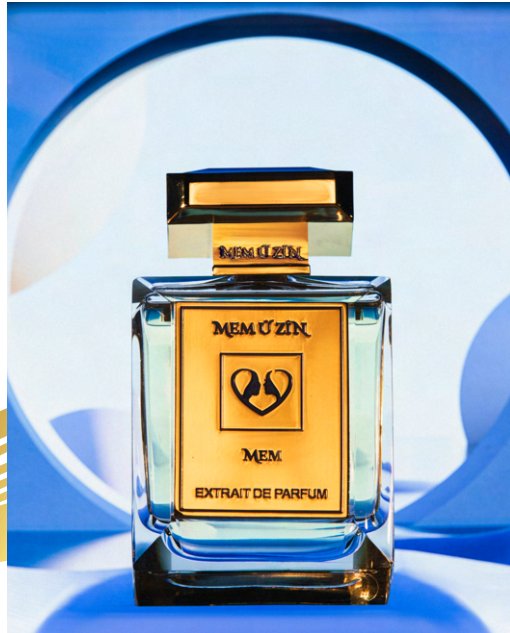
MEM EXTRAIT DE PARFUM