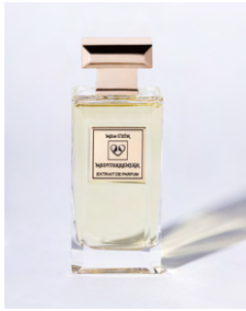
MEDITERRENIAN EXTRAIT DE PARFUM 100 ML

TOP NOTES: bergamot, grapefruit, ginger MIDDLE NOTES: marine notes, lavender, jasmine BASE NOTES: patchouli, vetiver, amber