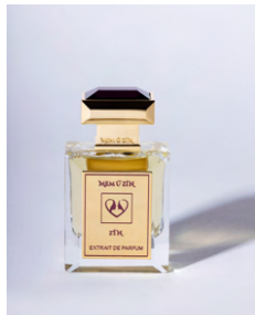
ZIN EXTRAIT DE PARFUM 100 ML