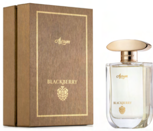
AURUM BLACKBERRY 75 ML WOMAN

Top Notes; Lime, Ginger, Pink Pepper, Mineral accord Heart Notes; Elemi, Jasmine, Orris, Olibanum, Cedar Tree, Rice Base Notes; Sandalwood, White Musk, Milk