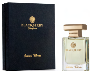
JASMINE TUBEROSE BLACKBERRY 50 ML UNISEX

This rare scent "Coffe & Baccardi" was carefully created by Blackberry Perfume. This dance, in which coffee and bacardi, unique to Latin culture, play the leading role, turns into a magnificent festival with the addition of vanilla, woody and spicy scents.