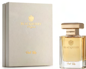
PINK TULIP BLACKBERRY 50 ML UNISEX

You find yourself in an oriental land in this composition where oud and sandalwood are at the forefront; The modern combination of rose and spice accompanies you. Oud Exclusive, which gives the feeling of touching nobility, offers a completely different experience.