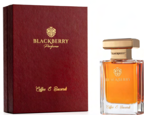
COFFEE & BACARDI BLACKBERRY 50 ML UNISEX

Sun-kissed with citrus zest and aromatic herbs a garden : Blackberry Musk. Basil, jasmine, lily of the valley and freesia flowers come together in a bunch; Deep down, treasures such as amber, musk, patchouli and tonka bean are waiting to be discovered.