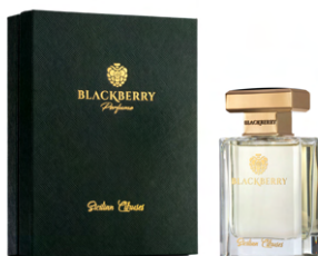
SICILIAN CITRUS BLACKBERRY 50 ML UNISEX

Rose Of Damascus, a complete fragrance mosaic, starts with a sweet rose, you will feel fascinated by this art where we see the harmonious unity of contrasting scents such as fruity scents and woody .