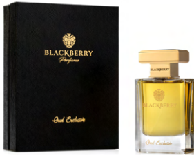
LOUD EXCLUSIVE BLACKBERRY 50 ML UNISEX

Designed with inspiration from Eastern tales, Orient Tale makes its entrance with the enchanting harmony of cardamom and ginger. In the development part, jasmine, laurel and cinnamon are included, ending with styrax (balsamic) and vetiver (woody) notes, this exquisite scent appeals to both eastern and western cultures.