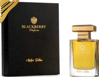
AMBER SULTAN BLACKBERRY 50 ML UNISEX

Top Notes; Pink Pepper, Thyme, Cinnamon Heart Notes; Vanilla, Patchouli Base Notes; French Laden, Sandalwood, Amber