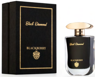
BLACK DIAMOND BLACKBERRY 75 ML WOMAN

AURUM lime, inspired by the enthusiasm of the sun that gives positive energy to the universe, It creates a citrus-spicy, sophisticated opening created by pink pepper and ginger. In the heart the floral breeze of orris and jasmine; the freshness of cedar tree, elemi tree and frankincense in your entire being. You will feel it. It makes a pleasant farewell with deep notes of white musk, milk and sandalwood. Blackberry Perfume; It was specially designed for women who shine brightly around them.