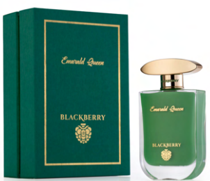
EMERALD QUEEN BLACKBERRY 75 ML WOMAN

Red is the symbol of lust, love, dynamism and power that evokes courage. Caesar's Ruby, which comes to life in fragrance; white gardenia, lily, jasmine, orange flower, floral garden consisting of cistus rose and peach blossom, evoking fiery passions. Blackberry Perfume It was prepared by for women who never miss sweet excitements in their lives.