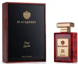
ROYAL GRANATH BLACKBERRY 85 ML UNISEX

The scent of free spirits: it is impossible to resist this sexy scent blended with fresh bergamot, green apple and modernized classic rose. Rose bergamot combination; With Royal Sapphire, which opens with lemon, melon and green apple and offers a beautiful, rich bouquet of flowers consisting of rose and violet accompanied by warm notes of sandalwood and amber, you will not only feel the freedom, you will touch it . Blackberry Perfume Royal collection was prepared for both women and men.