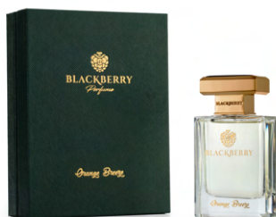
ORANGE BREEZE BLACKBERRY 50 ML UNISEX

Narcissus, inspired by the mythological character who, according to legend, turns into a narcissus flower after death; It symbolizes spiritual representation. After opening with the refreshing scent of bergamot, it blends with narcissus and jasmine flower. In the middle notes, the magnificent freshness of the orange flower sits at the heart of the scent. This work, a monument of elegance, ends on a base of musk and sandalwood.