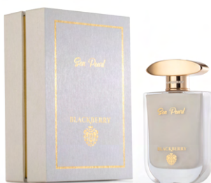
SEA PEARL BLACKBERRY 75 ML WOMAN

Venus, the goddess of beauty, wears green in her most attractive and noble form. Emerald Queen, inspired by the emerald that gives birth to peach, red forest fruits and It opens with ginger, cardamom and saffron sprinkled with savory notes of caramel. From the heart notes the freshness created by woody and herbaceous notes such as cedar, sandalwood, patchouli, albdanum, gurjun gives a tropical feeling. It creates air. At the base, amber musk, lemon balm and slightly mossy to the woody sweetness of vanilla. Accompanied by notes. This rich and multicolored fragrance for women by Blackberry Perfume was designed.