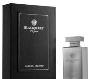
PLATINUM ATLANTIC BLACKBERRY 85 ML MAN

This mystical elixir promises a dreamy paradise: it opens with sophisticated notes of bergamot, nutmeg, black pepper and coriander. Like an invitation to immortality, a floral heart reveals fascination and captures the senses. Rose and magnolia come together in the middle notes. Amber folds create a smooth and generous scar, leaving a feeling of endless happiness on the skin. This journey is completed with the touch of precious patchouli, musk, benzoin and tonka bean with amber. GOLD PATCHOLULI was specially designed by BlackBerry Perfume for men to invite them to this mysterious journey.