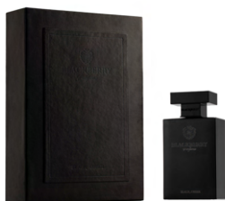
BLACK AMBER BLACKBERRY 85 ML MAN

Royal Malachite, designed as a tribute to nature's art of creation; It starts with incense that highlights green . Then, the spring-inducing touch of lily and rose is felt in the heart note. The rare fragrance, which has become indispensable with the dizzying scent of vetiver and beet coming from the depths, was prepared by BlackBerry Perfume for both women and men within the Royal collection.