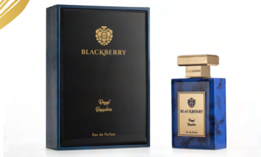
ROYAL SAPPHIRE BLACKBERRY 85 ML UNISEX

Top Notes; Bergamot, Lemon, Melon, Green Apple Heart Notes; Rose, Violet Base Notes: Sandalwood, Amber