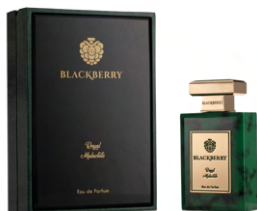
ROYAL MALACHITE BLACKBERRY 85 ML UNISEX

Royal Granath, specially designed within the BlackBerry Perfume Royal collection, resembles a colorful feast. This feast , where delicious citrus fruits, fascinating flowers, sweet amber touches, earthy woods, that is, appetizing notes, and oriental notes come together , reveals indescribable emotions. Blackberry Perfume Royal collection has been prepared for both women and men. Are you ready to join this long-lasting, mouth-watering feast?