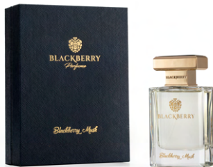
BLACKBERRY MUSK BLACKBERRY 50 ML UNISEX

Offering influences from Eastern culture, Amber Sultan offers; The strong combination of rose and amber is accompanied by spicy and woody notes. This exquisite scent has vanilla and cinnamon in its base notes ; It resembles the art of marbling, where colors blend together in harmony.