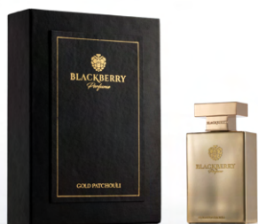
GOLD PATCHOULI BLACKBERRY 85 ML MAN

Designed with inspiration from the night splendor of the ancient city of Istanbul, Black Amber opens with cardamom, lavender and apple; woody notes such as cedar and iris take their place in the middle, and the scent of amber, which is the base note, is felt with all its nobility. Are you ready to touch nobility with Black Amber designed for BlackBerry Perfume men's collection ?