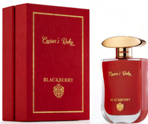
CAESARS RUBY BLACKBERRY 75 ML WOMAN

Black Diamond is a cocktail that truly exudes happiness; its opening is fresh and a fruity-lactonic mixture of pear, apple, coconut and raspberry notes. The heart notes offer a harmonious combination of woody-spicy notes of sandalwood, cedarwood, moss, vetiver saffron and pink pepper. The refreshing beginning of the scent is supported by an edible-musk finish that envelops a comfortable trace of vanilla, chocolate tonka bean, caramel, musk and solar notes. As the Blackberry Perfume family, it has been carefully prepared to add color to the lives of you, precious women.