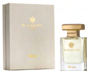
NARCISSUS BLACKBERRY 50 ML UNISEX

A scent of intrigue rising in the middle of the Egyptian spice market, an intoxicating harmony with the partnership of jasmine, tuberose and white musk integrated with the elegance of Istanbul; At the base, sandalwood and amber invite you to a world of permanent happiness with a warm embrace; a fragrant tale where spices and flowers intertwine and leave a lasting impression: Jasmine Tuberosse.