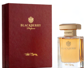
WILD CHERRY BLACKBERRY 50 ML UNISEX

Experience a vibrant world with sparkling grapefruit, lemon, and bergamot. Linden and vetiver transport you to sunny fields, while warm amber, leather, and vanilla add sensual elegance. A unique blend of apple and black currant offers a fascinating journey. Delight in floral notes of jasmine, lily of the valley, and rose. Citrus and thyme create a refreshing peak, while a base of amber, leather, and vanilla embraces luxury and freshness.