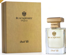
ORIENT TALE BLACKBERRY 50 ML UNISEX

Top Notes; Cardamom, Ginger Heart Notes; Jasmine Flower, Bay Leaves, Cinnamon Base Notes; Vetiver, Styrax